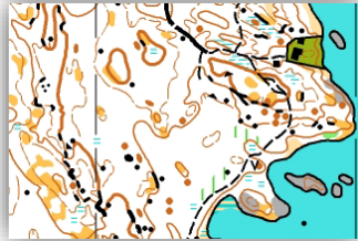
Map sample Long distance